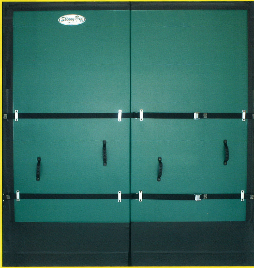
SHOWN WITH OPTIONAL ABRASION GUARD AND E STRAPS

ITW's light weight rigid bulkhead The value you requested & performance you expect!